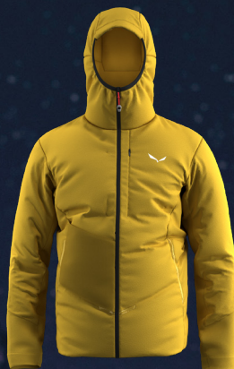
/ PEDROC TIROLWOOL AIR HYBRID JACKET M