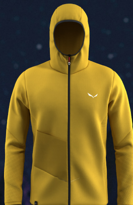
/ PEDROC PL WIND HOODED JACKET M