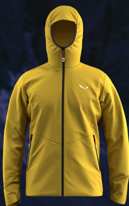
/ PEDROC WIND HOODED JACKET M